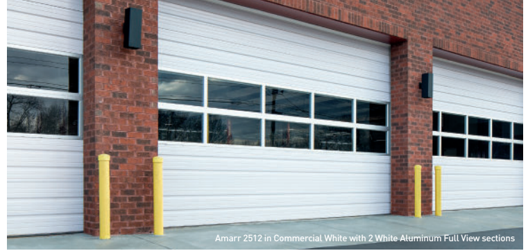
Amarr 2512 in Commercial White with 2 White Aluminum Full View sections

2" ribbed panel commercial steel doors are available in a variety of steel gauges and feature tongue and groove construction with a bottom weather seal to guard against the elements. These doors can be factory or field modified with HCFC-free polystyrene insulation to fit the needed application.